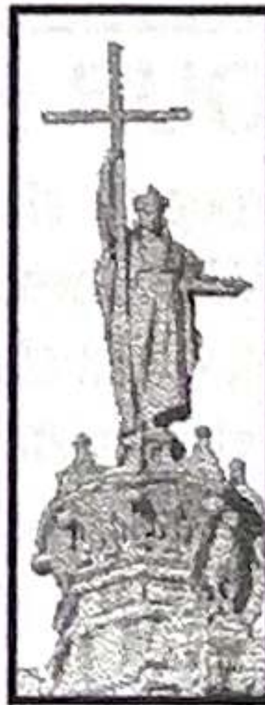
St Helen on the top of the tower of Colchester Town Hall

[Western Easter this year falls on 23 April, a week before ours]